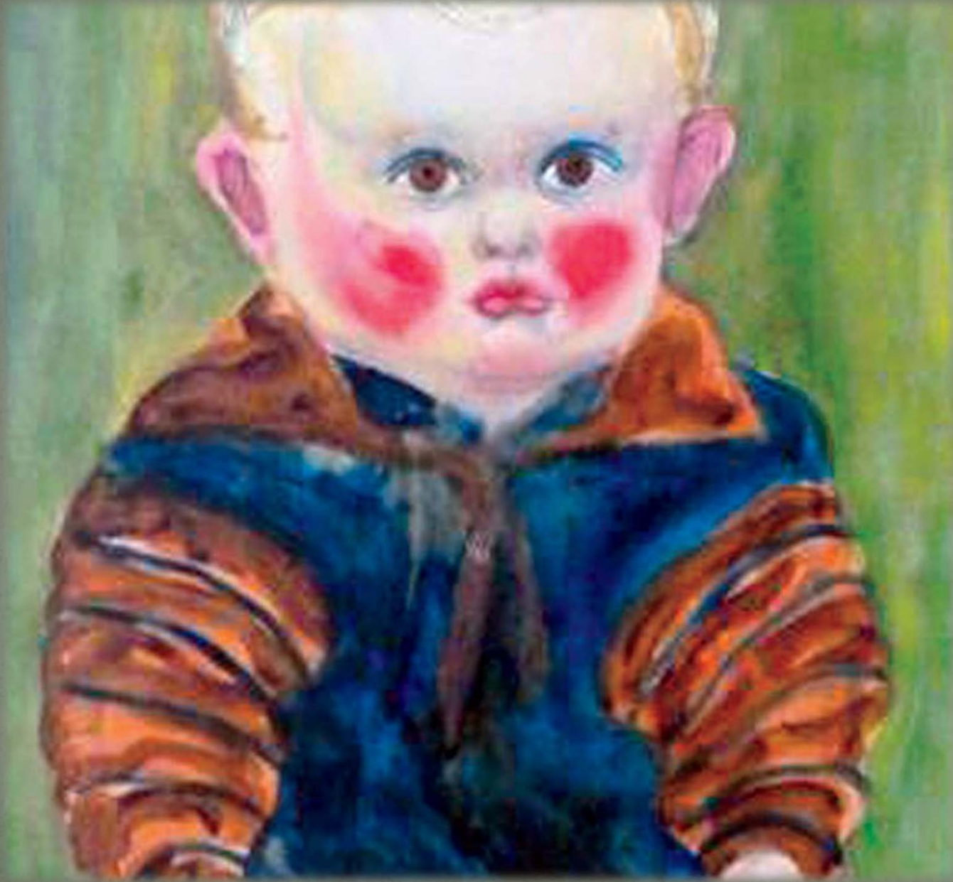
Child at a Table, by Otto Gabriel