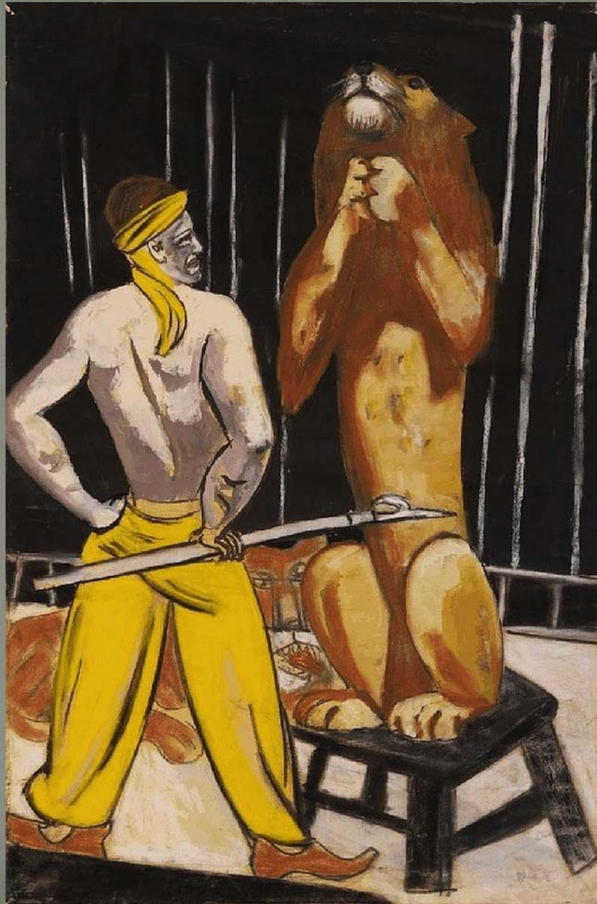
The Lion Tamer , by Max Beckmann