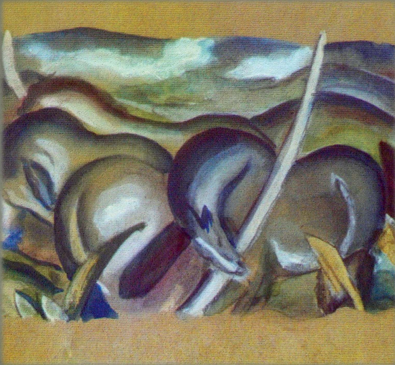
Landscape with Horses, by Franz Marc