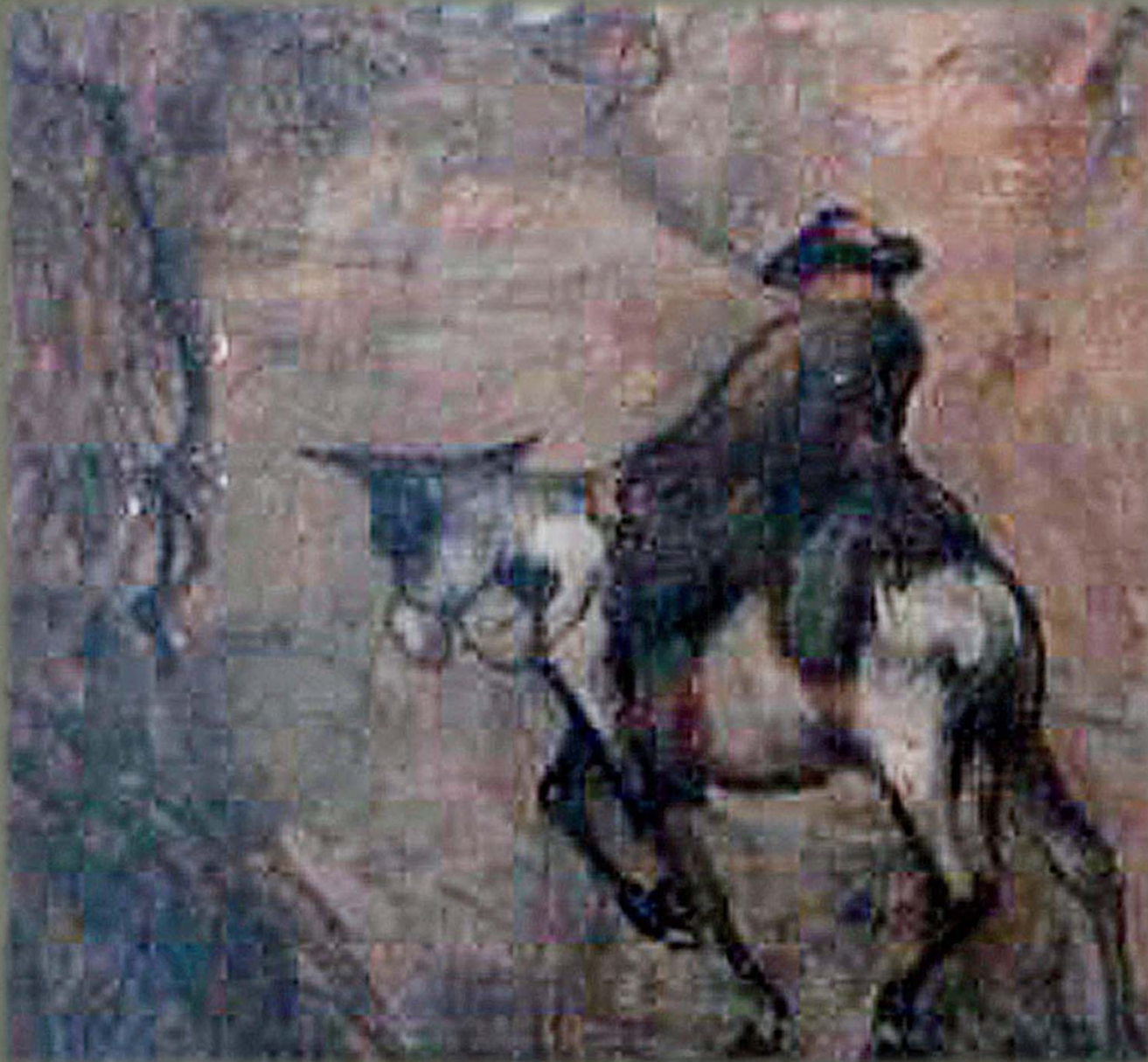
Don Quichote and Sancho Panza, by Honoré Daumier