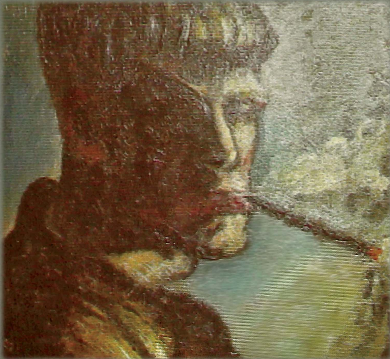
A self-portrait, by Otto Dix